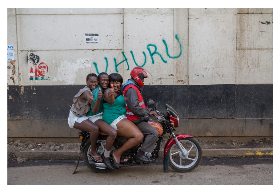
Figure 2. Image from the Nairobi exhibit Diaper Mentality.

Diaper discourses, I have shown, help people express and negotiate aspirations and anxieties related to bodies, work, respectability, and progress even in circumstances unrelated to sex. This means that public revelations of diapered adults reflect a cultural logic independent of—though, at times, overlapping with—discourses of sexuality. Diaper Mentality , the photography exhibit curated by Mwangi and PAWA 254, illustrates how this cultural logic forms a technology of citizenship, a way to produce subjects within national frames of moral propriety.