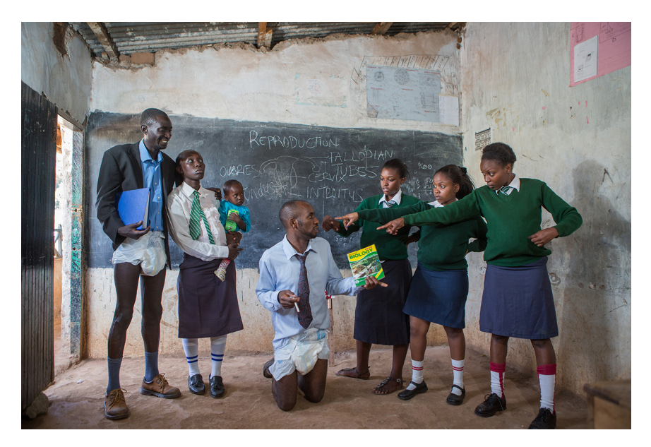
Figure 3. Image from the Nairobi exhibit Diaper Mentality. Image by PAWA 254.

The use of diapers is metaphoric. Not actual ruptures caused by sexual penetration or illness render bodies incontinent, but immorality broadly construed. Although a significant number of photographs focus on sexuality, they nevertheless dissociate bodily incontinence from actual sexual penetration. In a particularly evocative picture, three female high school pupils, all pregnant, point their index fingers at the male teacher who impregnated them. Another male teacher who has already sired a baby with a schoolgirl, stands nearby, looking indifferent (see Figure 3). The phenomenon of teachers impregnating schoolgirls has seen widespread debate in recent decades. In this image, the accused appears on his knees, holding up a biology book, against the background of a blackboard with terms related to sexual reproduction. The image thus ridicules supposedly pedagogical circumstances that lead to such pregnancies and exposes male teachers as failed persons. Notably, the teachers wear diapers not because they have been penetrated, but